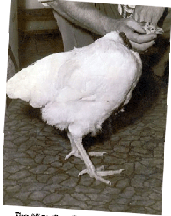
The "Headless Wonder Chicken" lived for 18 months without a head