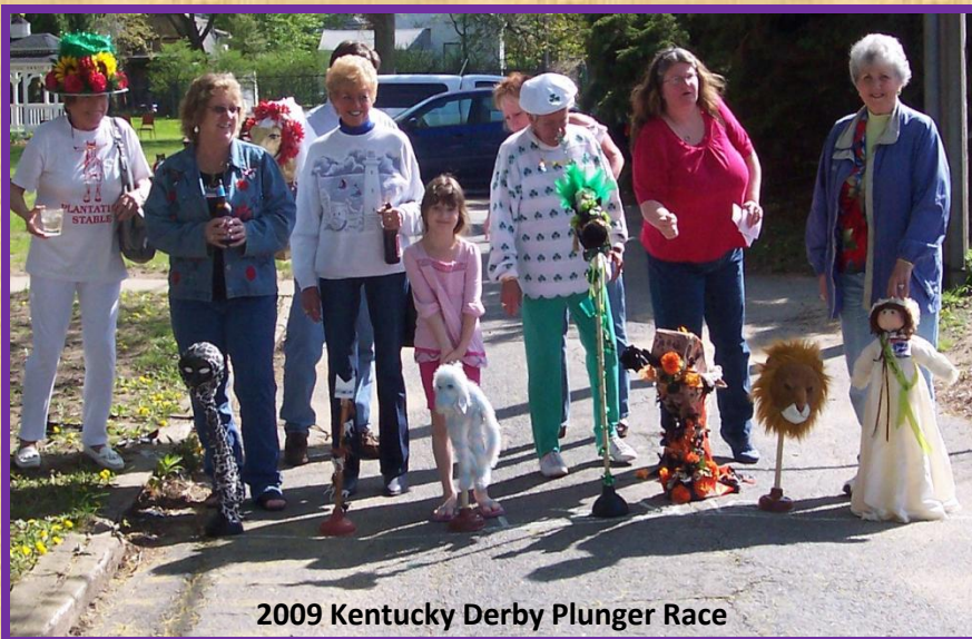
2009 Kentucky Derby Plunger Race